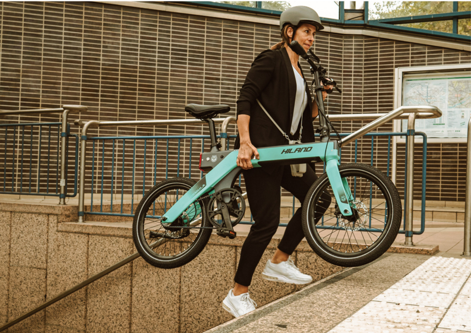
20" MAGNESIUM ALLOY FOLDING BIKE